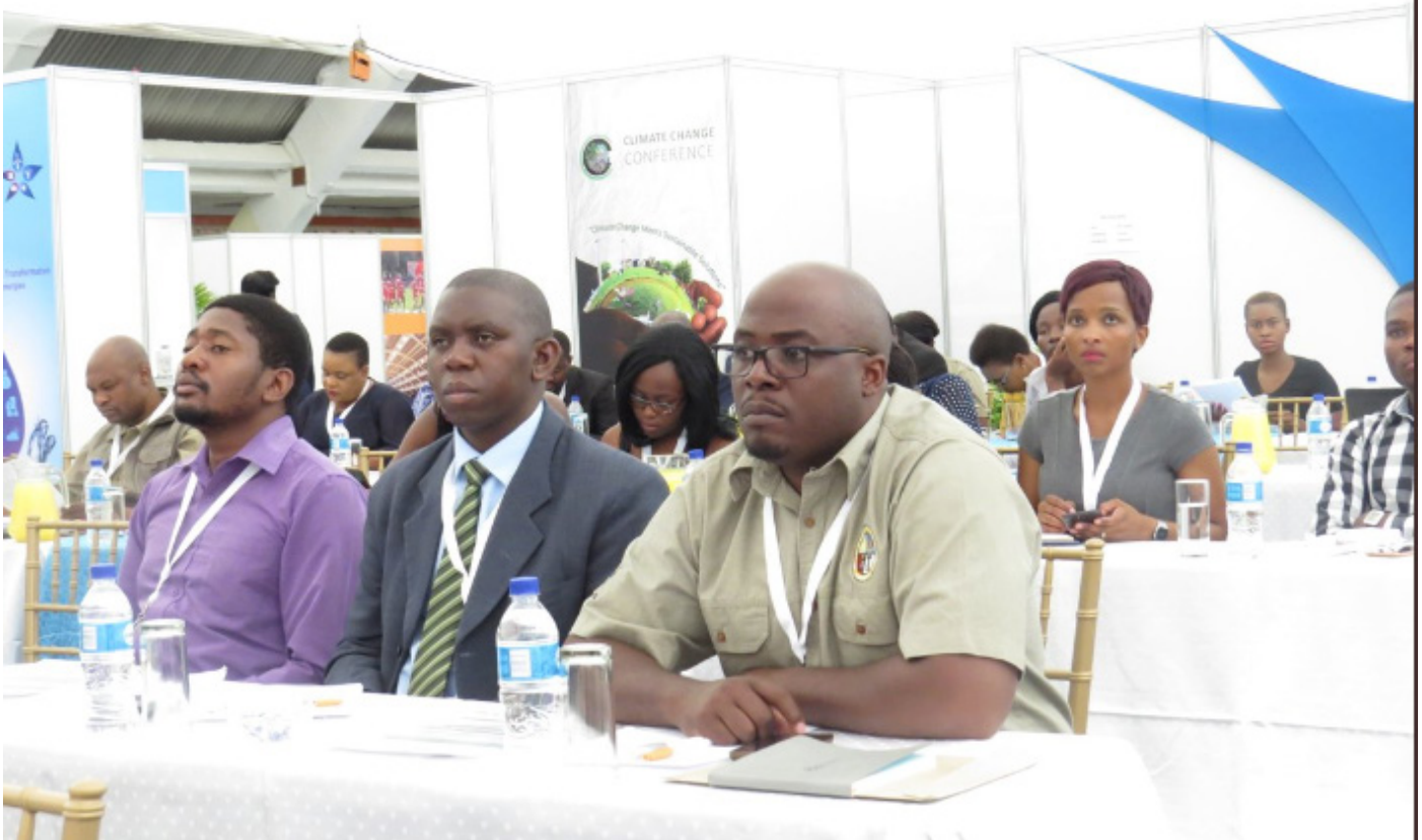
NUST REPRESENTATIVES AT WASHen CONFERENCE