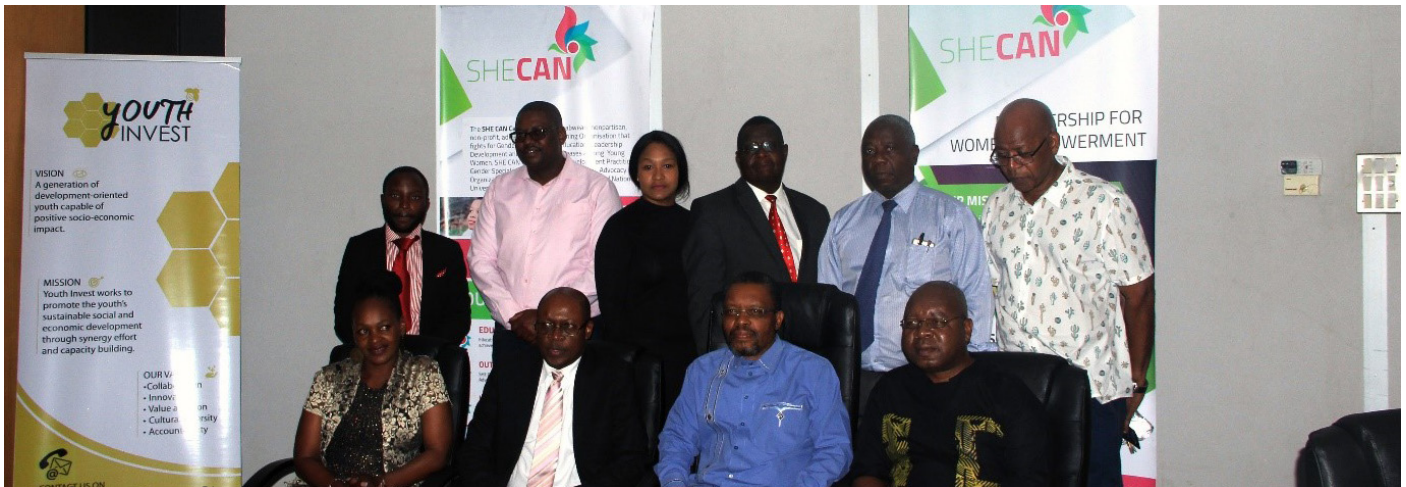
NUST and SHECAN members

A Zimbabwean based NGO called SHECAN launched an MBA scholarship and a leadership fellowship programme in conjunction with the NUST Graduate School of Business and the Ministry of Women Affairs, Gender and Community Development.